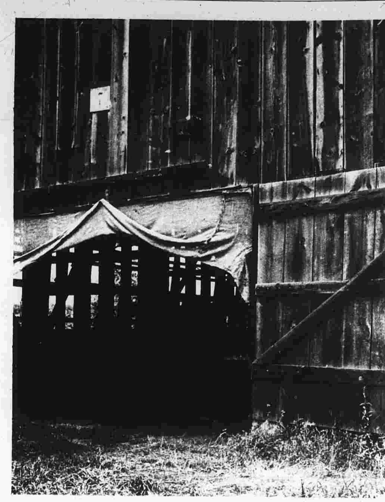
TOBACCO BARN